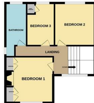
110 THE AVENUE, LOWESTOFT

Whilst every attempt has been made to ensure the accuracy of the floorplan contained here, measurements of doors, windows, rooms and any other items are approximate and no responsibility is taken for any error, omission or mis-statement. This plan is for illustrative purposes only and should be used as such by any prospective purchaser. The services, systems and appliances shown have not been tested and no guarantee as to their operability or efficiency can be given. Made with Metropix ©2026